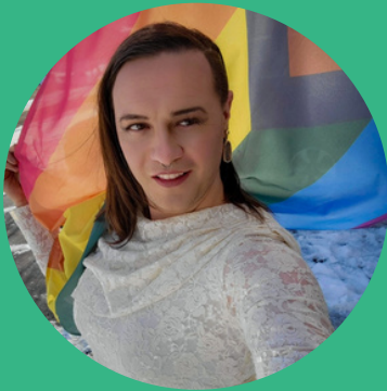
NV Gay Director